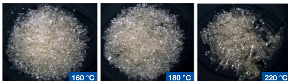
Kollidon® VA 64 extrudates obtained at different extrusion temperatures

Kollidon® VA 64 can be extruded up to 220 °C without any polymer degradation.